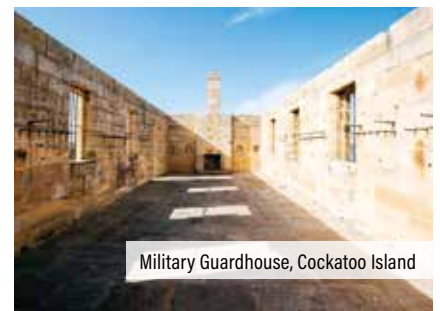
Military Guardhouse, Cockatoo Island

Cockatoo Island , a UNESCO World Heritage-listed island in the middle of the Sydney Harbour, just a ferry ride away from Barangaroo, is like a cat that's lived through nine lives. Used as a convict penal colony, as well as the site of one of Australia's biggest shipyards until 1991, the island now contains the nation's most extensive and varied record of shipbuilding. Drawing numerous events like the Biennale, it's also a great place to meet, either for a conference or a cocktail event, in spaces like the small conference centre, the Mould Loft or on one of the numerous outdoor lawns all of which showcase breathtaking views of the Sydney Harbour Bridge.