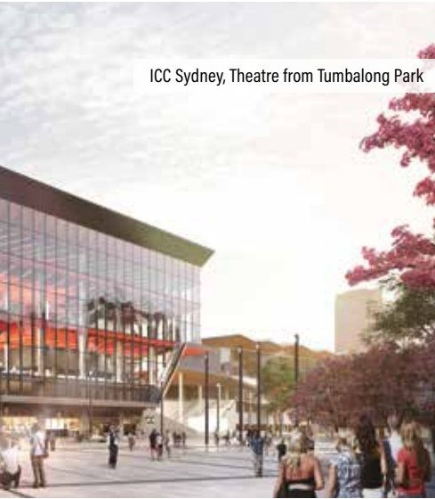
ICC Sydney, Theatre from Tumbalong Park