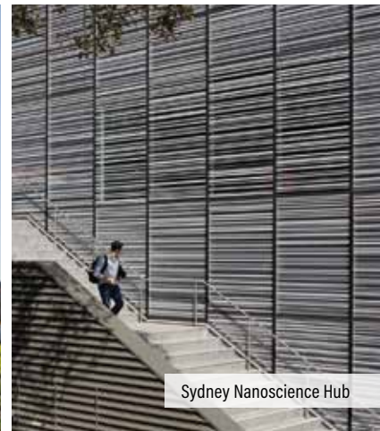
Sydney Nanoscience Hub