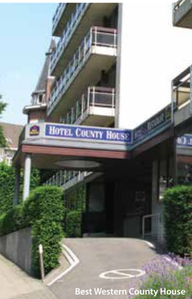
Best Western County House