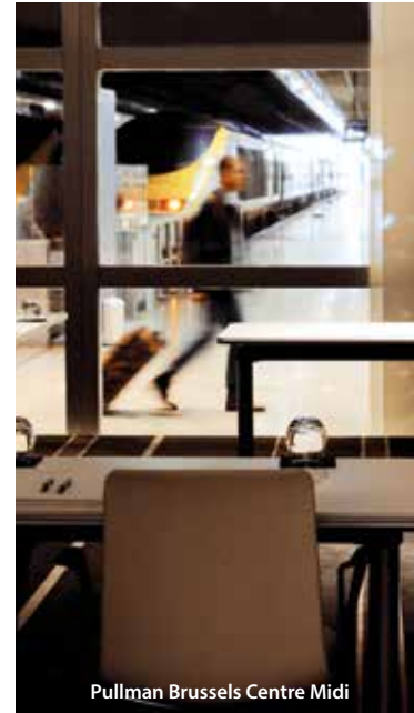
Pullman Brussels Centre Midi