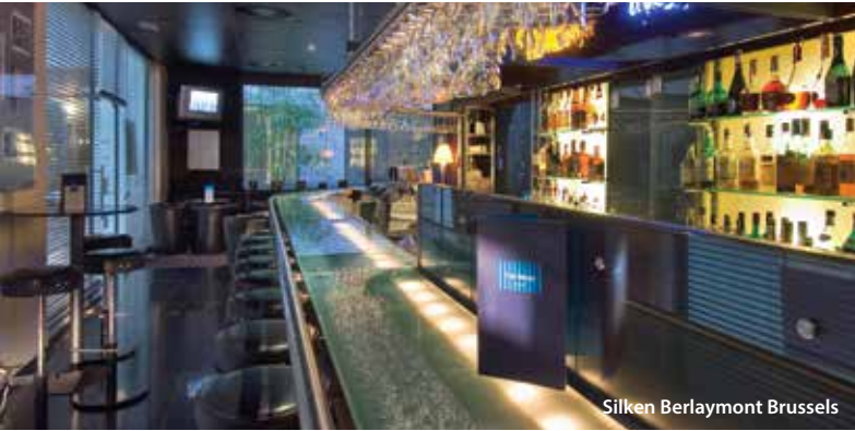
Silken Berlaymont Brussels