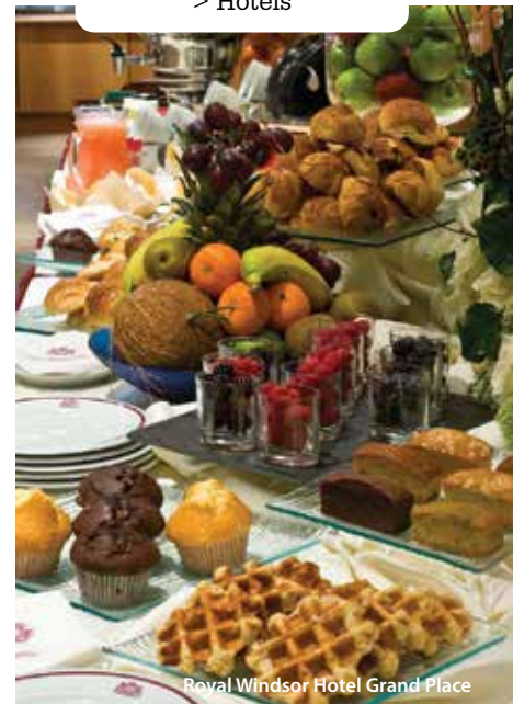
Royal Windsor Hotel Grand Place