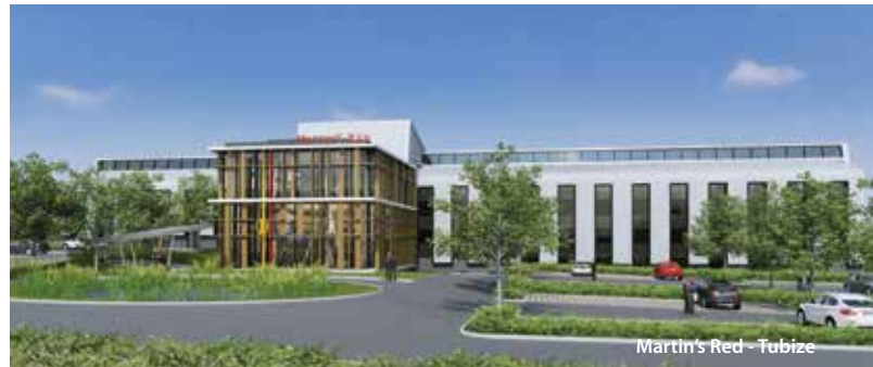
Martin's Red - Tubize