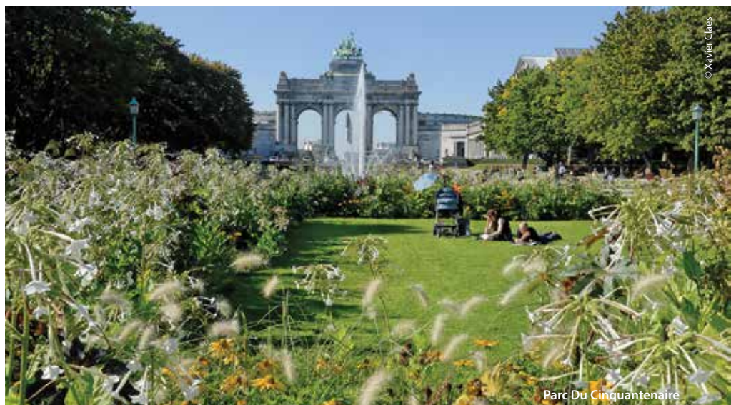
Parc Du Cinquantenaire