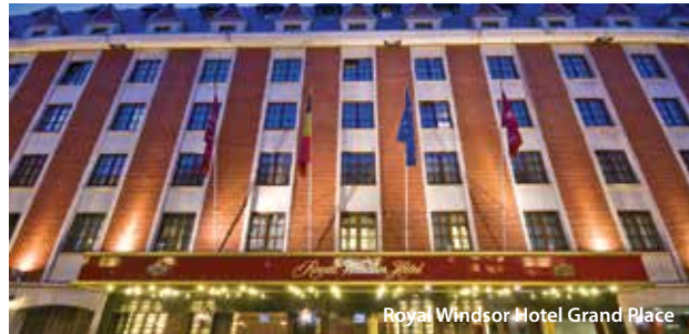
Royal Windsor Hotel Grand Place