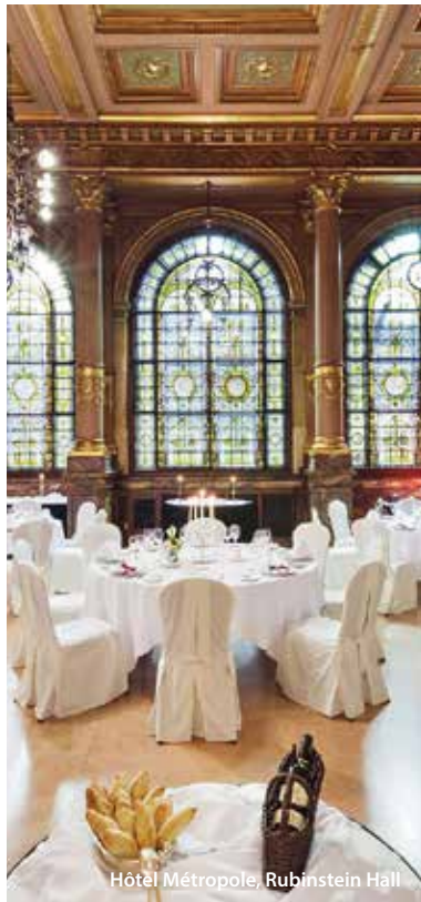
Hôtel Métropole, Rubinstein Hall