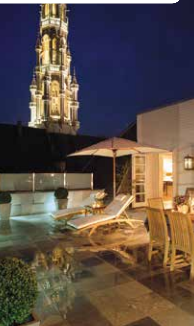
Hotel Amigo - Armand Blaton Suite Terrace