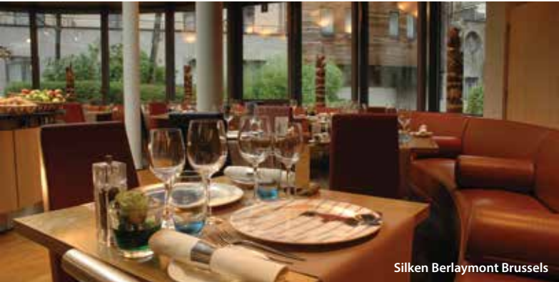
Silken Berlaymont Brussels