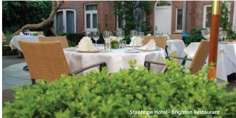
Stanhope Hotel - Brighton Restaurant