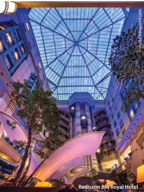
Radisson Blu Royal Hotel