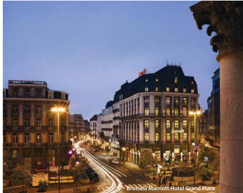
Brussels Marriott Hotel Grand Place