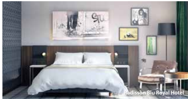
Radisson Blu Royal Hotel