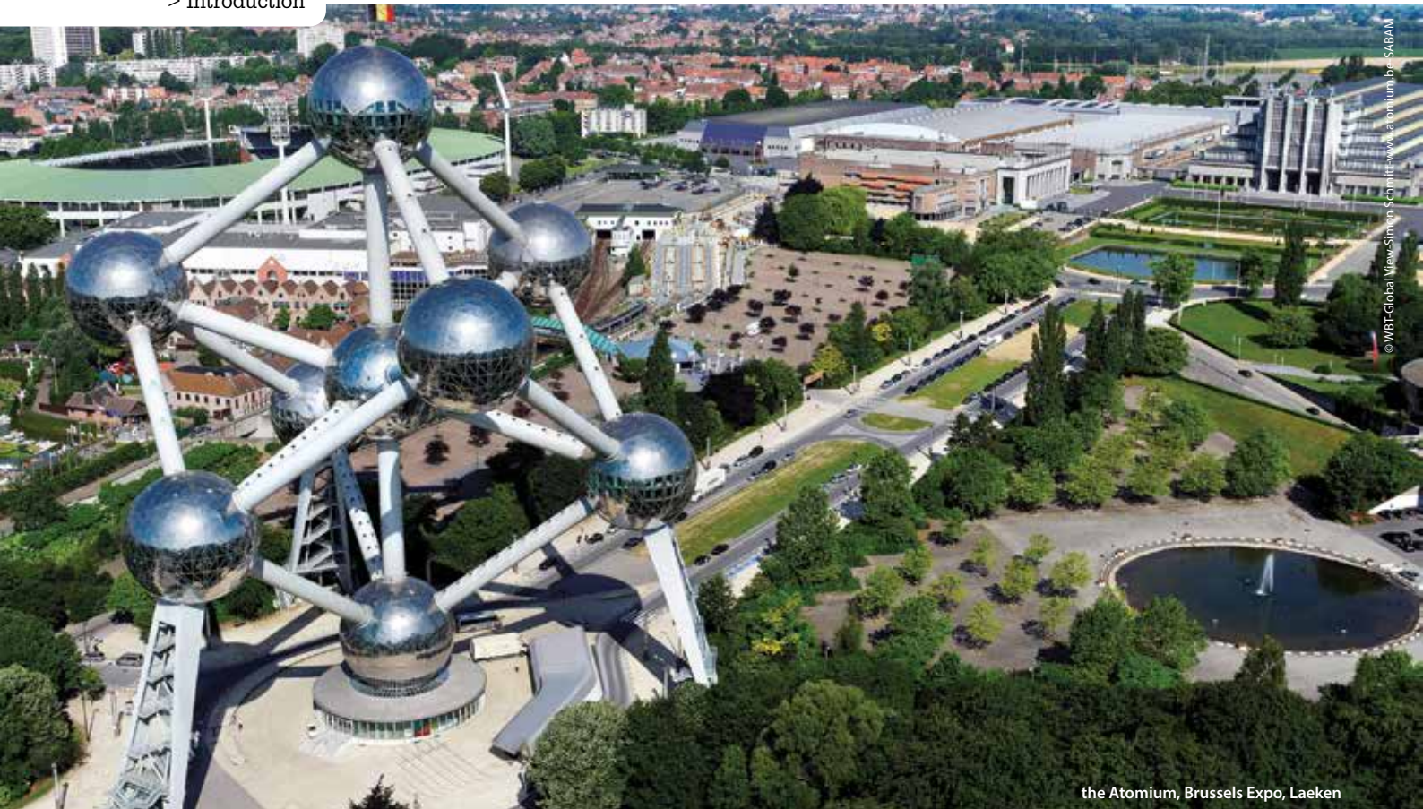
the Atomium, Brussels Expo, Laeken