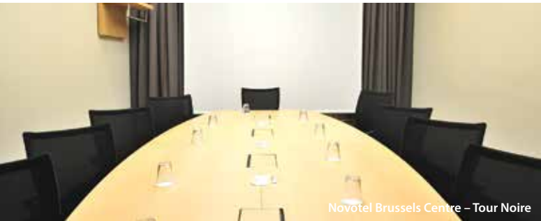
Novotel Brussels Centre – Tour Noire