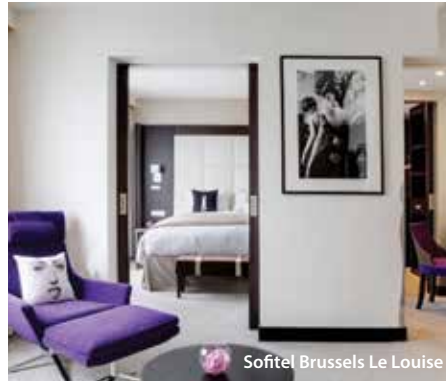
Sofitel Brussels Le Louise