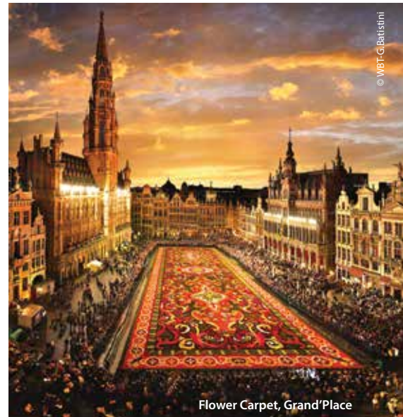
Flower Carpet, Grand'Place