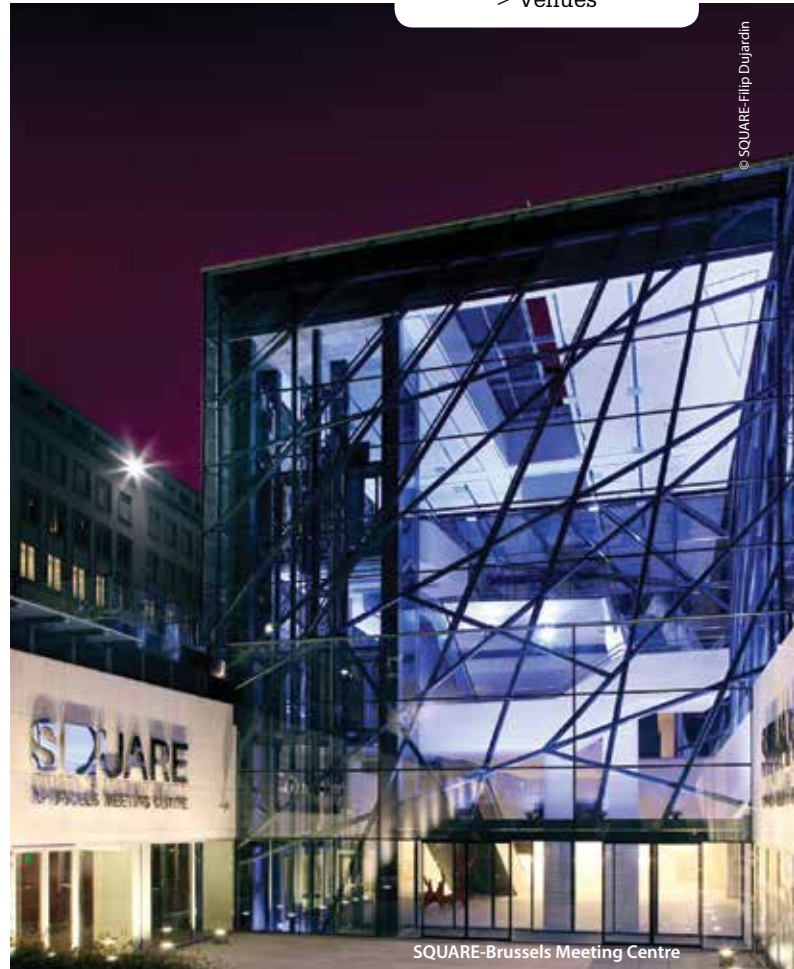
SQUARE-Brussels Meeting Centre