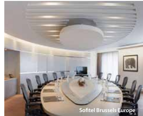
Sofitel Brussels Europe