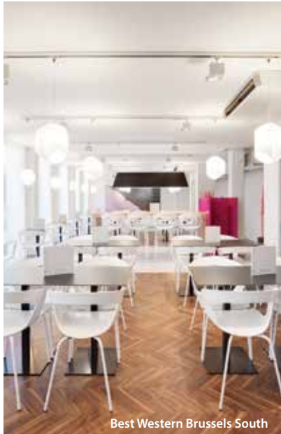
Best Western Brussels South