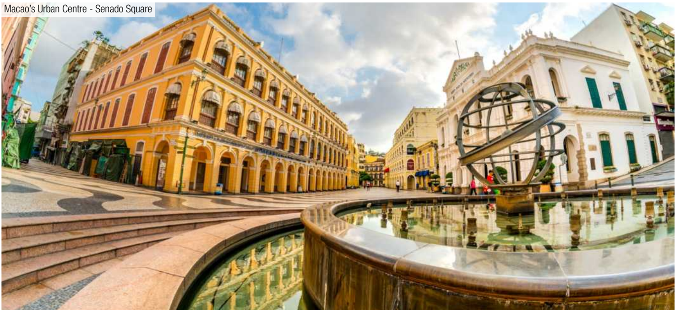
Macao's Urban Centre - Senado Square

Macao was a former Portuguese colony, returned to China in 1999. The Portuguese arrived in