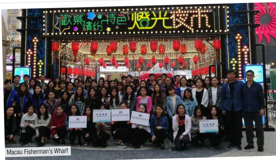
Macao Fisherman's Wharf