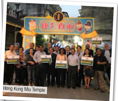
Hong Kung Miu Temple