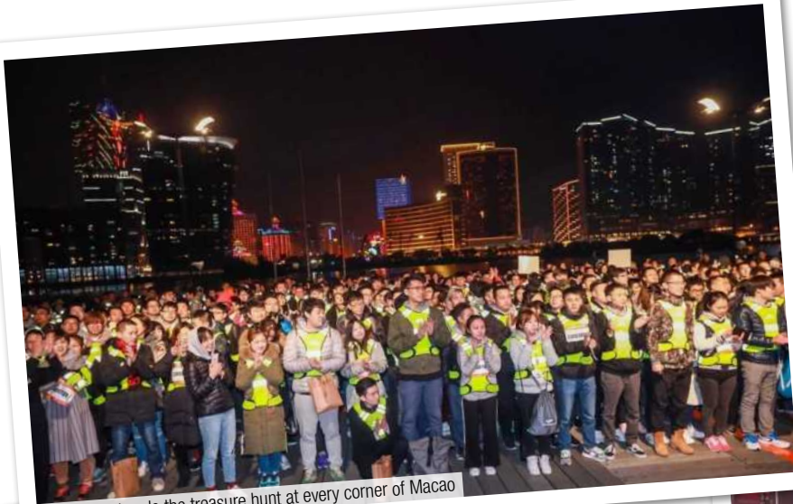
800 delegates do the treasure hunt at every corner of Macao