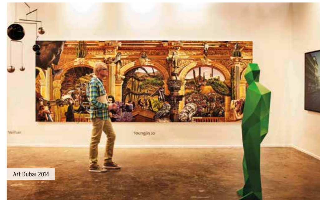
Art Dubai 2014

This year, the 34 th International Congress of the International Society of Blood Transfusion will bring 4,000 delegates to Dubai, one of the major wins for the Emirate as the city beat out other potential hosts