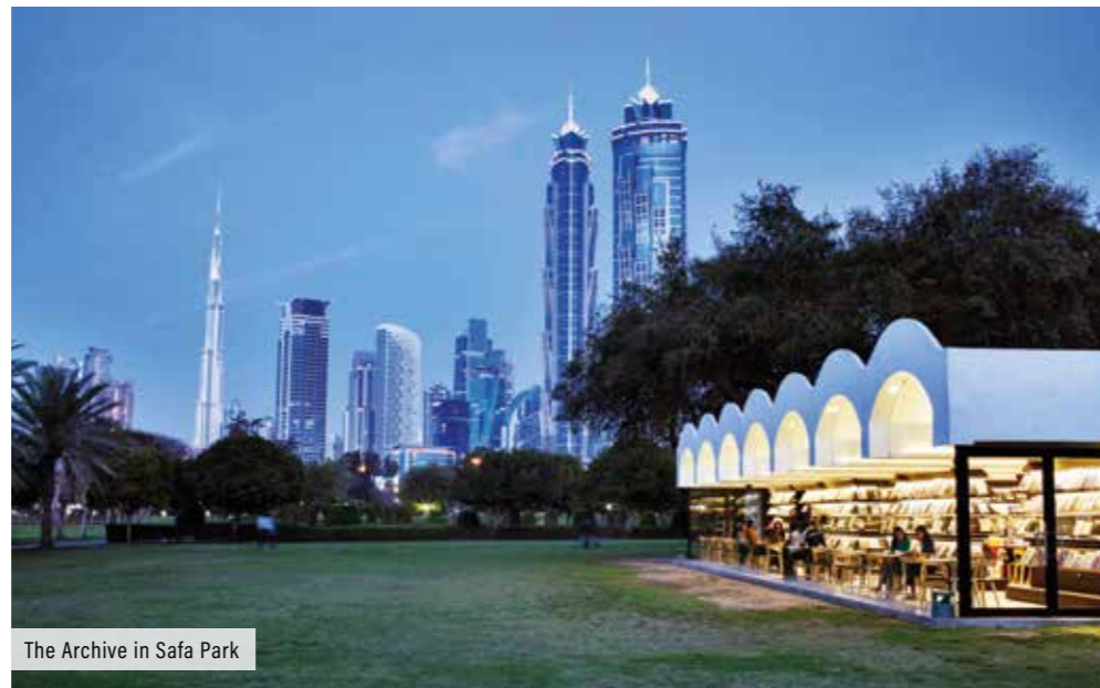
The Archive in Safa Park

Almost 1.5 billion Euros will be invested in research centres at academic institutions across the UAE focusing on the development of STEM (science, technology, engineering and mathematics). Universities such as Zayed are not only promoting this idea of innovation, they're doing it in a very 21 st century way. Students are trained to think independently and as leaders so they can utilize this knowledge post-graduation and contribute positively to Dubai's society.