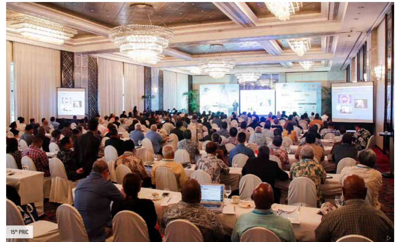
15 th PRIC

"For me personally, the country I have favoured for the annual conference has been the Philippines. More specifically in Makati, Manila. The city offers a highly educated workforce in the financial services industry that I have found to very open to new ideas"