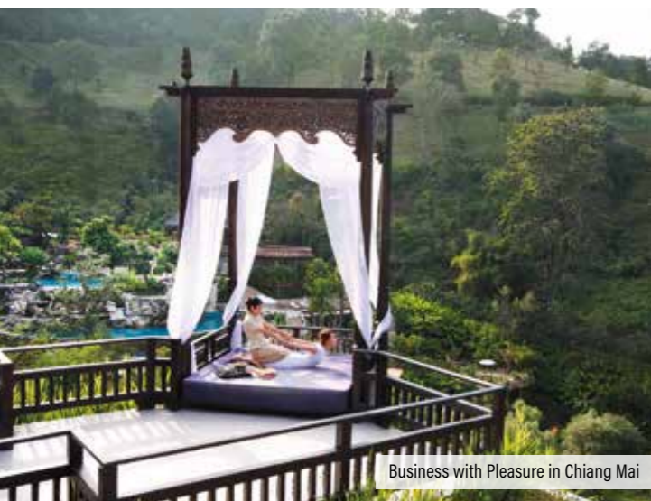
Business with Pleasure in Chiang Mai