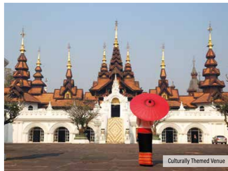
Culturally Themed Venue