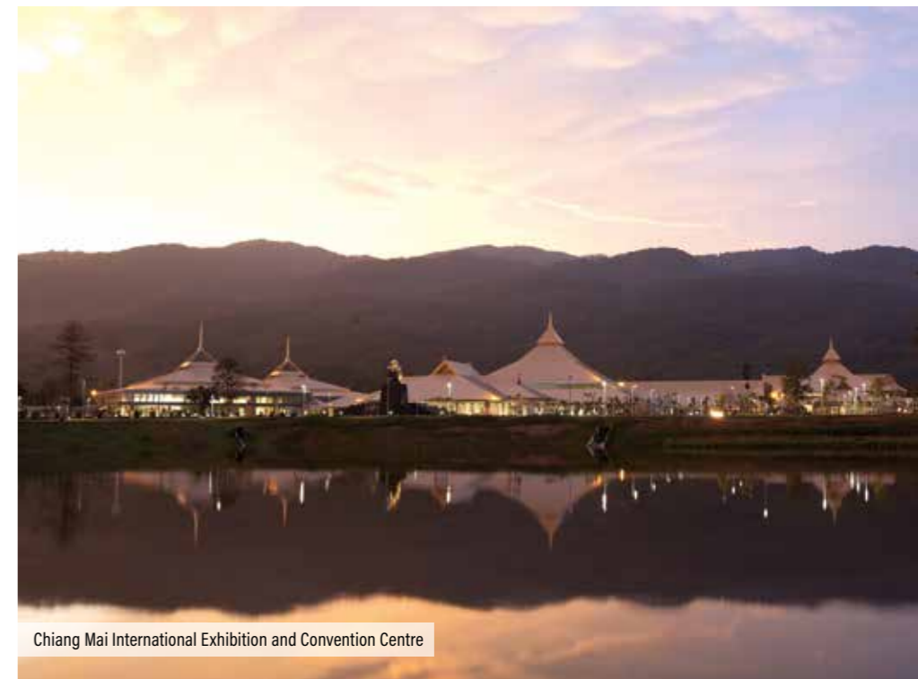
Chiang Mai International Exhibition and Convention Centre

ASEAN, Asia Pacific and world events are all catered for in Chiang Mai, with knowledge areas covering a wide scope of topics, from biology and medical, to engineering, agriculture, energy, environment and natural resources. With the 50-year-old Chiang Mai University and its long-established and solid profile in both social and applied science courses and programs, it's clear to see that Chiang Mai has become a trusted convention destination. ▷