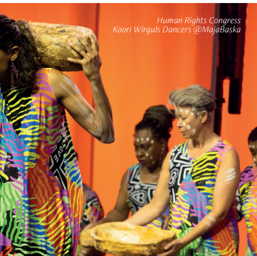
Human Rights Congress Koori Wirgul's Dancers

“ During the 2024 PCMA Convening Leaders, the PCMA Foundation and BESydney unveiled the findings of a new global study on the advancement of women in business events that addresses the issue of gender disparity in the leadership of the industry. In addressing these inequalities, the authors identified a set of actions to promote women in senior leadership positions and remove barriers to their personal, professional and social development.