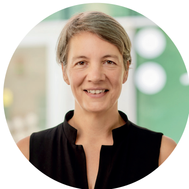
Professor Michelle Simmons AO

Professor Michelle Simmons AO is the founder and CEO of Silicon Quantum Computing and director of the Centre of Excellence in Quantum Computing and Communications Technology , as well as being a senior lecturer at the University of NSW Scientia . In 2018, she was named Australian of the Year and won the 2023 Prime Minister’s Award for Science for her work in creating the new field of atomic electronics. World-renowned in quantum computing, Prof Simmons is leading advances in atomic electronics with the aim of creating a scalable phosphor-silicon quantum processor, colloquially known as a “supercomputer”. This meticulous approach has yielded seminal new inventions aimed at developing all the functional elements needed for a scalable, error-correcting, spin-based quantum computer by 2033. Simmons’ leadership in this cutting-edge field not only positions her group at the forefront of international research, but also sets the stage for significant advances in quantum computing technology.