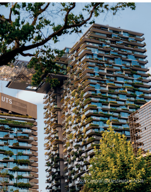
Tech Central @Destination NSW