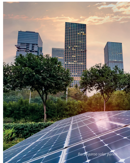
Barangaroo solar panels