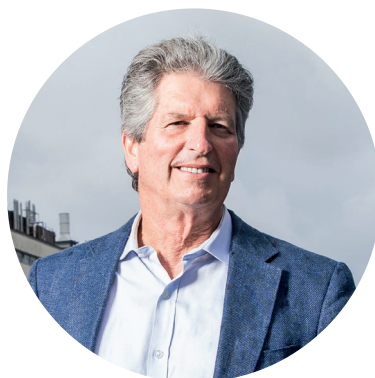
Professor Martin Green AM

Known as the “father of photovoltaics” (solar panels), Professor Martin Green AM has led the race to capture the sun’s energy and convert it into electricity for more than 30 years. He is Scientia Professor at the University of NSW , and Director of the Australian Centre for Advanced Photovoltaics , involving several other Australian universities and research groups. Since creating his first solar cell in 1975, Prof Green and his team have seen their tests and discoveries rival NASA and COMSAT in the race to create a cell with 20% efficiency, breaking multiple records. His group’s contributions include holding the silicon solar cell efficiency record for 30 of the last 39 years, described as one of the “top ten” milestones in the history of solar photovoltaics. Conferences have been essential to his achievements and, which has secured funding for an educational centre for photovoltaic technology in Asia-Pacific. Prof Green thus remains committed to tackling one of the biggest global problems we face today: climate change.