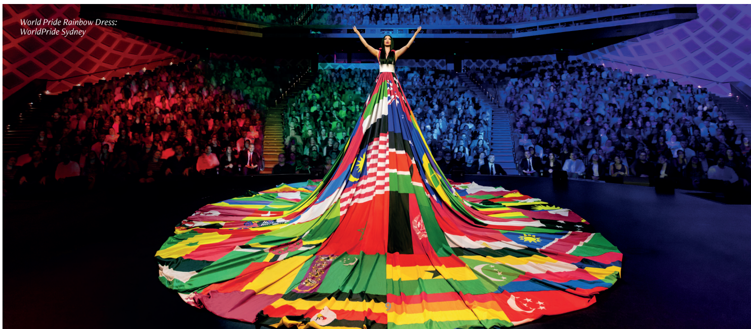
World Pride Rainbow Dress: WorldPride Sydney

One of the challenges planners face today is how to adapt virtual and hybrid formats to their in-house programs. By understanding the difference between depth of experience and breadth of engagement, and how each format relates, planners can decide the most strategic approach. From streamlined ticket sales to immersive virtual reality gatherings, ICC Sydney delivers end-to-end event solutions through its Connect Hub: a one-stop digital event solution featuring a dedicated media studio, digital concierge, video editing suite and digital signage management. Additionally, the venue's tailored digital events platform, ICC Sydney Connect, offers a comprehensive package for hybrid event management.