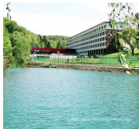
Parc Hotel Alvisse surroundings