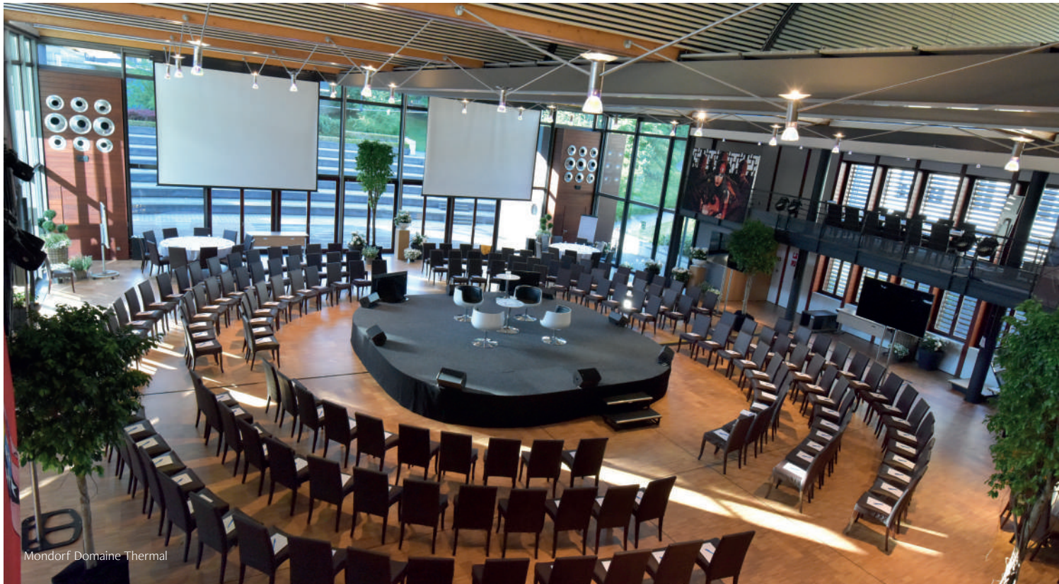
Mondorf Domaine Thermal