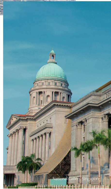
National Gallery Singapore

Housed in two of Singapore’s most historic buildings – the Old High Court and City Hall – the National Gallery Singapore is a renewed icon for the 21st century overseeing the largest public collection of modern art in Southeast Asia. The Gallery’s prime location and stunning state-of-the-art spaces make it an ideal host for a wide variety of events, offering a multitude of venues – from the expansive Supreme Court terrace to the Coleman and Padang rooftop terrace – that cater to organisers’ every need.