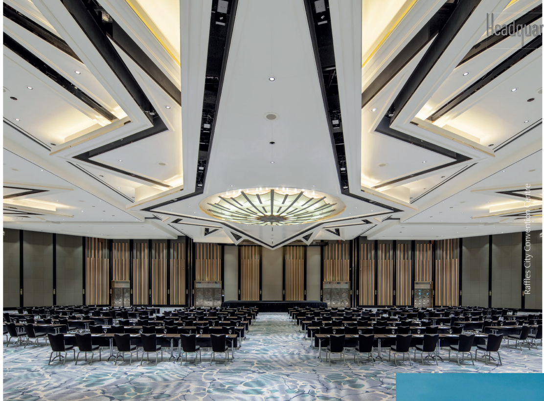
Raffles City Convention Centre