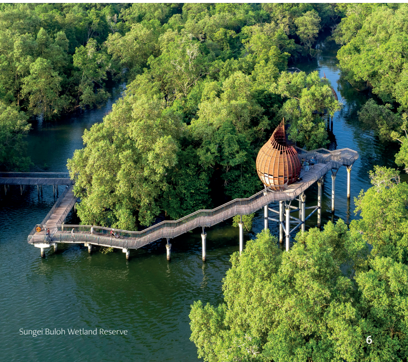
Sungei Buloh Wetland Reserve

The five key pillars of the Singapore Green Plan 2030 are: City in Nature; Energy Reset; Green Economy; Resilient Future; and Sustainable Living. New initiatives include targets to double electric vehicle charging points, reduce carbon waste by 30% by 2026, and review the carbon tax to facilitate best-