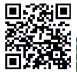
Flavours of Singapore

Scan the QR code to find out more about Singapore!