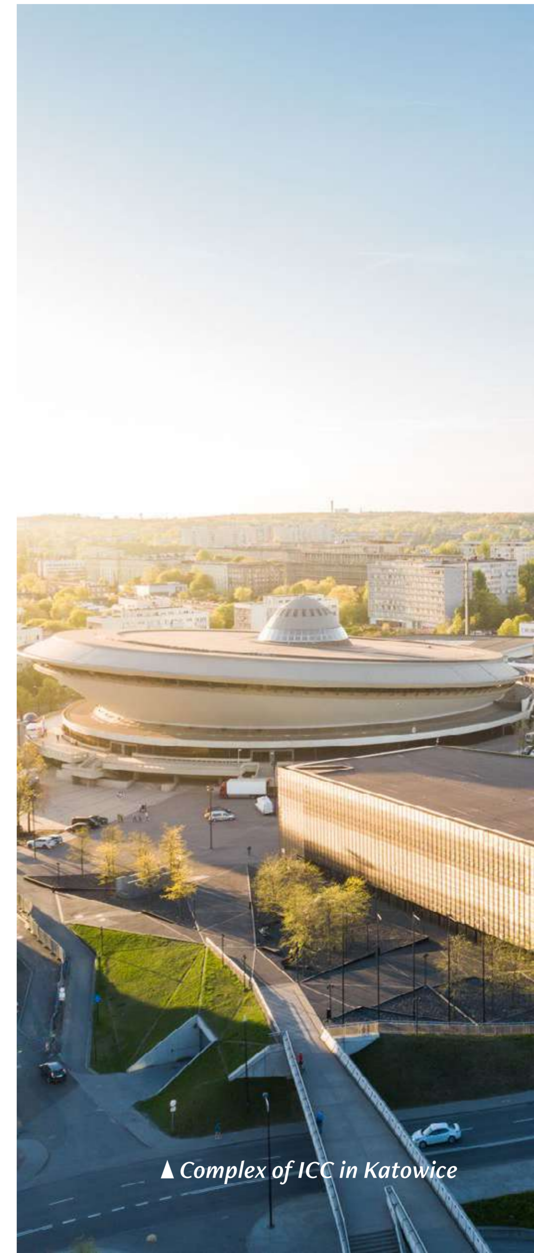
▲ Complex of ICC in Katowice

Among the standouts of Katowice , mention is due to the Culture Zone with the iconic Spodek , a modern concert hall of the Polish National Radio Symphony Orchestra, the International Congress Centre and the Silesian Museum seated in a former coalmine. When staying in Śląsk (Silesia), the Industrial Monuments Route is an absolute must-see, with special emphasis on the Guido Mine .