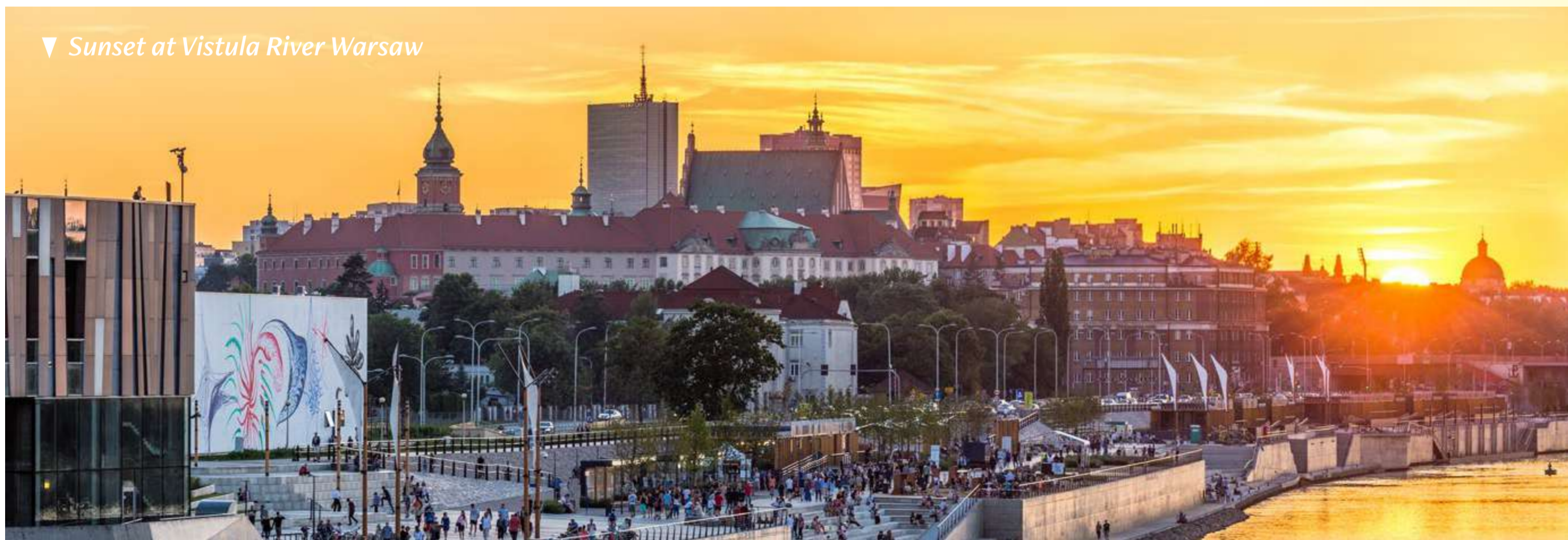
▼ Sunset at Vistula River Warsaw

The support shown by Polish Tourism Organisation , which runs the “Have a Safe Stay in Poland” campaign, certainly plays a crucial role in the above mentioned actions. The project encompasses two self-certification programmes: “Hygienically Safe Venue” aimed at hotels, and “Safe MICE Venue” , targeting convention centres. These two useful tools provide information about venues in accordance with the guidelines of health and safety authorities. Thanks to these efforts, the development of all types of events is now both safe and comfortable. After all, trust is the key to success in any personal and business relationship.