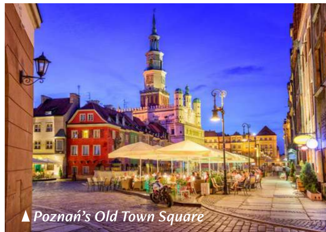
▲ Poznań's Old Town Square

Halfway between Warsaw and Berlin you will find one of Poland's oldest cities – Poznań , recognised as the cradle of Polish statehood and notable by its compact character. The Old Town Market Square , in its very centre, is a good starting point for learning more about the local culture and its quintessential products, such as the celebrated St. Martin's croissants in the Poznań Croissant Museum . In addition, the city holds a great selection of indispensable MICE infrastructure – hotels, office buildings, and superb trade show and conference facilities. The credit goes to Poznań International Fair , the largest organiser of this type of events in the whole Central and Eastern Europe. The complex includes the advanced Poznań Congress Center available for congresses, exhibitions and shows, with capacity for tens of thousands of participants. The airport is less than 7 km from the city centre (15 minutes by car) and the main accommodations are all within walking distance.